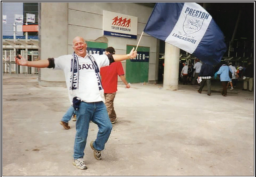
“A Lifelong P.N.E Fan”