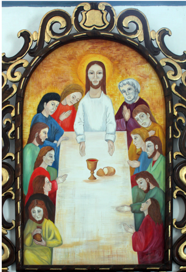
The Last Supper from the Cathedral of Sancti Spíritus, Cuba

Where is the artist focusing attention? What phrases from today's Gospel speak to this image?